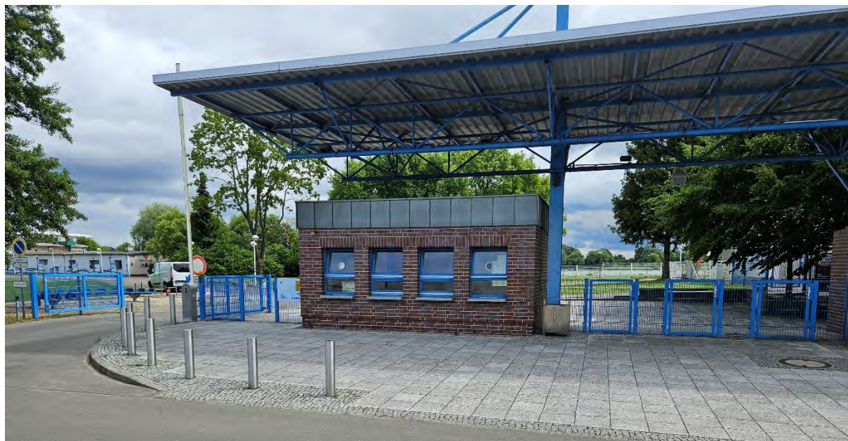
Figure 2 Regatta course entrance and accreditation