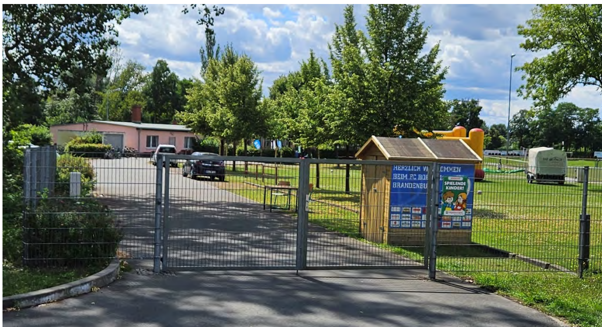
Figure 14 Entrance Camping