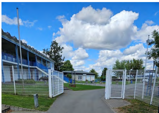
Figure 8 Entrance Competition Area