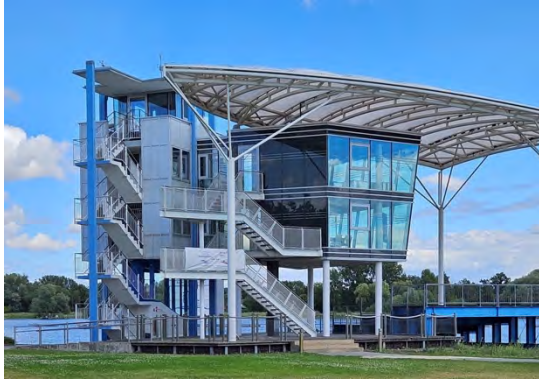
Figure 10 Competition Office, Main Referee