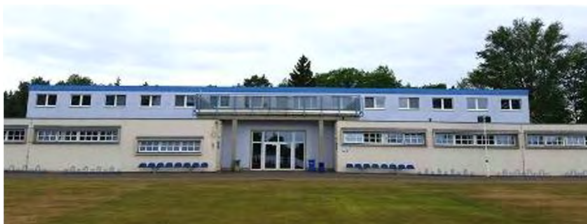
Figure 5 Multifunctional building