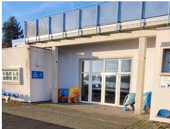
Figure 6 Entrance Catering