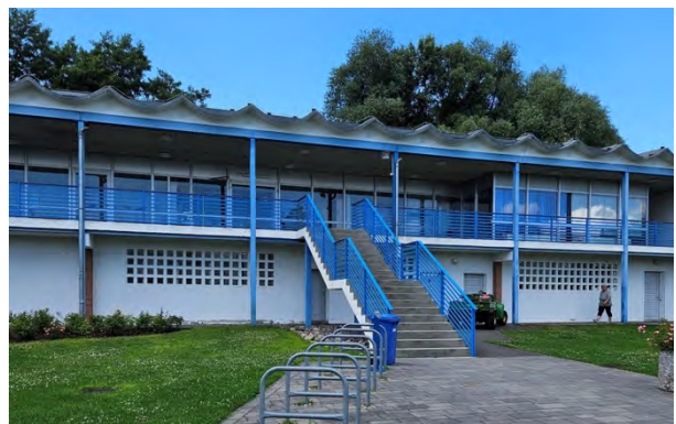
Figure 9 Organizing office and jury