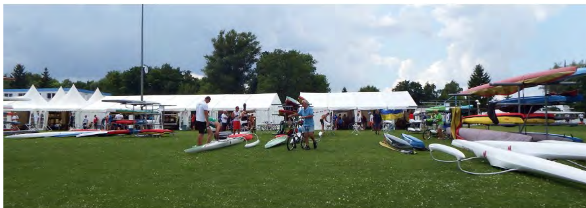
Figure 4 Nations Area und Nation Tents