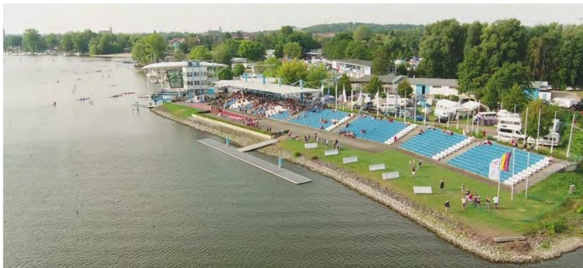
Figure 13 View of the spectator stands and pitches