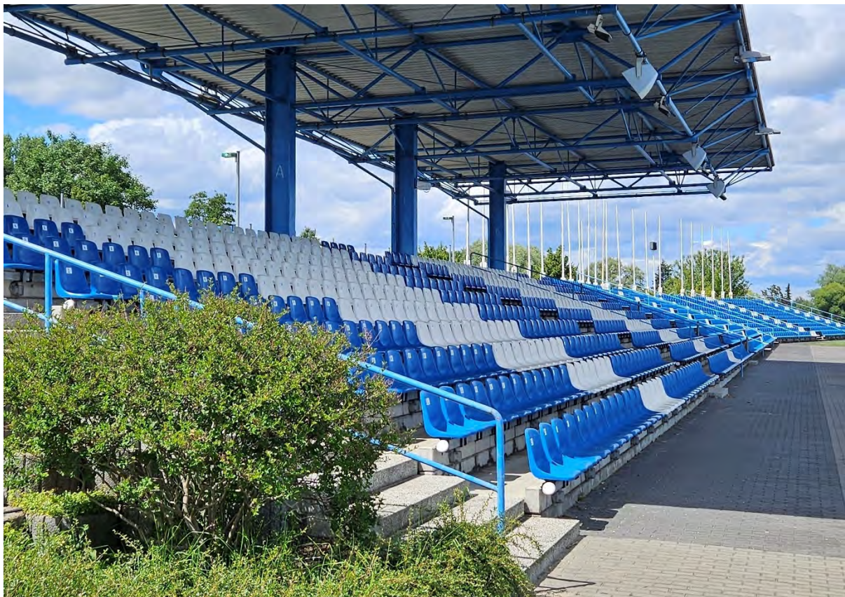
Figure 12 Spectator stand