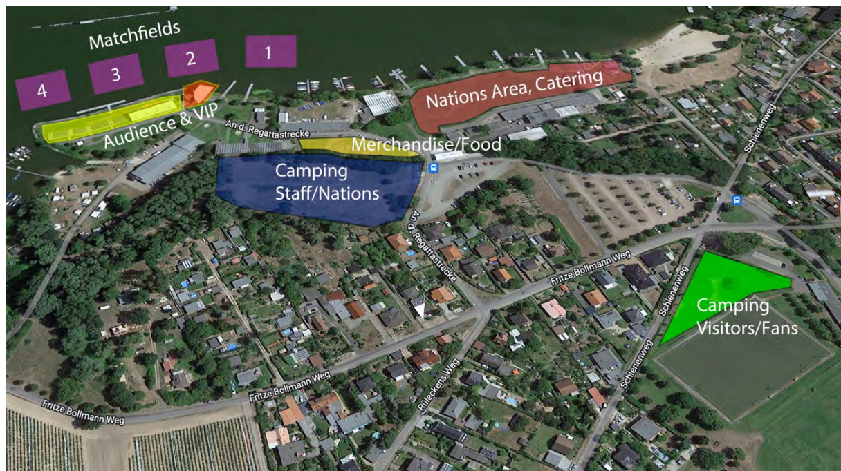
Figure 1 Overview regatta course and surroundings