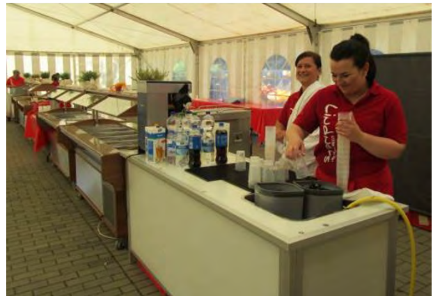
Figure 7 Catering