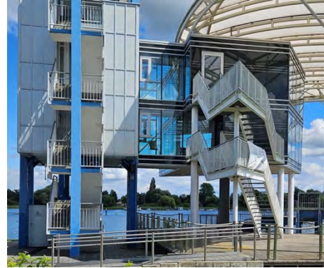
Figure 11 Competition Office Main Referee